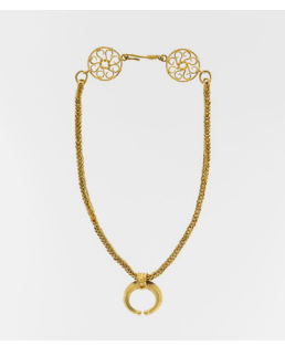
More images to show the type of jewellery commanding officer's wives would have worn.