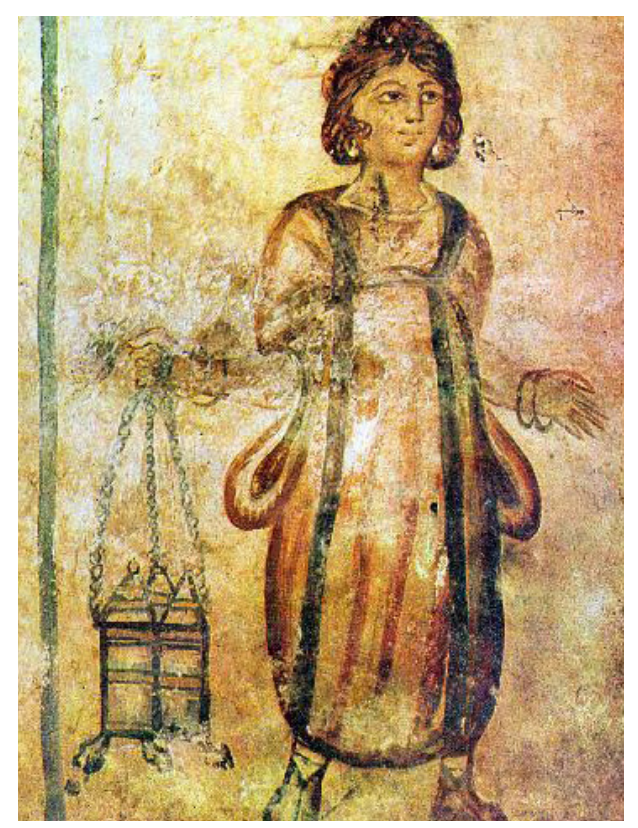
Illustration from a tombstone of a slave carrying a container of perfumed oils.

The commanding officer's wife was in charge of the house and slaves. It would be like running a small business, including planning meals, giving slaves access to locked stores, ensuring the house was clean and tidy, giving tasks to slaves, sorting out entertainment for guests, and dealing with any problems concerning the slaves.