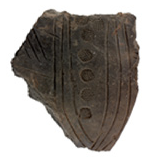
Sherd of Anglo-Saxon pottery found at Segedunum

Without anyone to maintain it, parts of the Wall gradually collapsed over the years. From the later Anglo-Saxon period, when people began to build in stone again, it was used as a convenient quarry for stone already cut to size. It still remained visible for many years, which is why the medieval villages of Wallsend and Walker include 'wall' in their name. Gradually, however, grass grew over it, soil built up and it disappeared – although the dip caused by the ditch were used as duck-ponds in local farms right up until the 1930s.