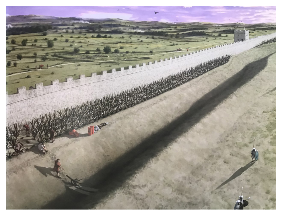
Branch entanglements were used in some parts between the Wall and Wall ditch.

The Wall was first built to be 3m wide. In front of the wall was a large ditch and mound, except where crags or rivers made this unnecessary. In some parts there were branch entanglements (like barbed wire) between the fort and ditch.