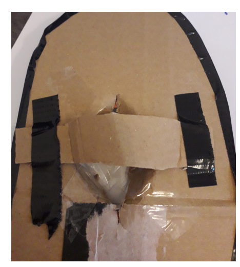
Step 7 Now it's time to practise your Roman soldier moves!