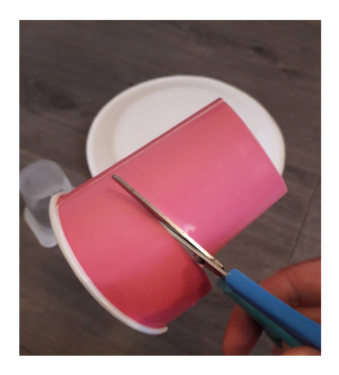
Step 3 Cut a cross shape in the middle of your shield. Ask an adult for help with this part if you need it.