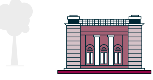
Shipley Art Gallery