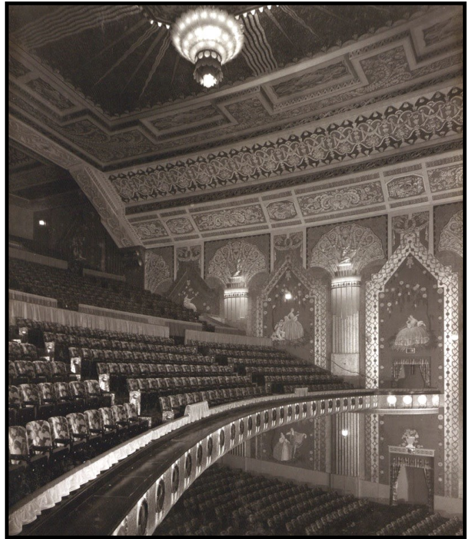
The Paramount, Newcastle in 1931

Many people have fond memories of going to the cinema in the past. Ask participants to recall the buildings they went to? Are they still around now? How much did it cost to see a film? What was the first film you saw at the cinema? What is your favourite film? When was the last time you visited the cinema? What has changed - then and now? What did you eat/drink?